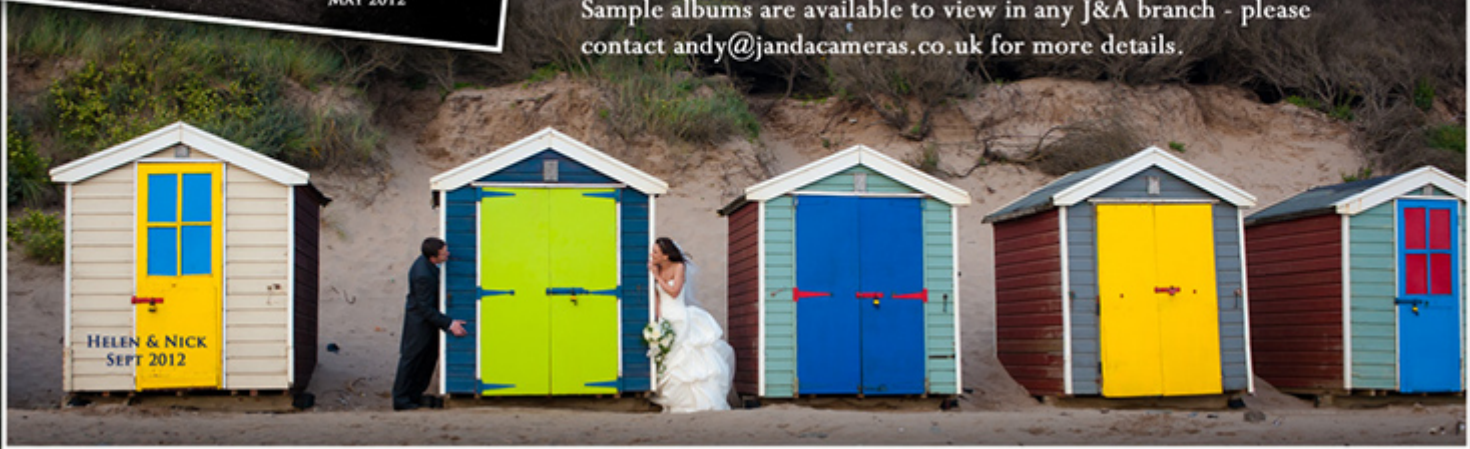
HELEN & NICK SEPT 2012

Sample albums are available to view in any J&A branch - please contact andy@jandacameras.co.uk for more details.