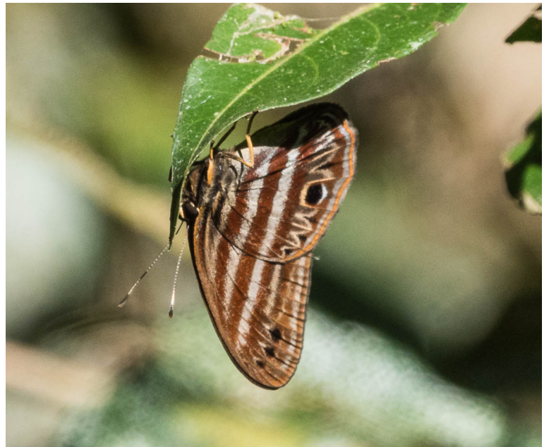
Top Left: Complete Jewelmark Bottom Left: Orange-banded Scintillant