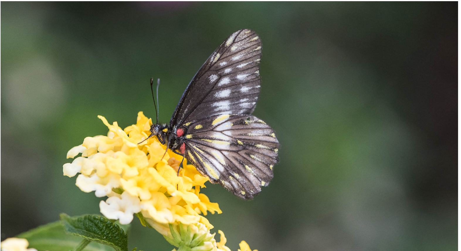
Top: Yellow-dotted Dartwhite Bottom: Narrow-banded Dartwhite