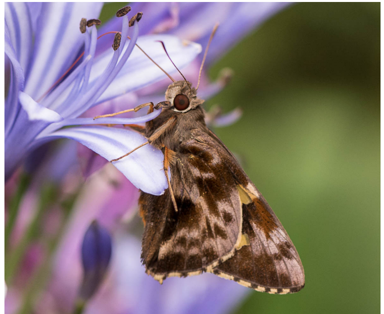
Top Left: Tomato-studded Skipper Bottom Left: Telegonus sp.