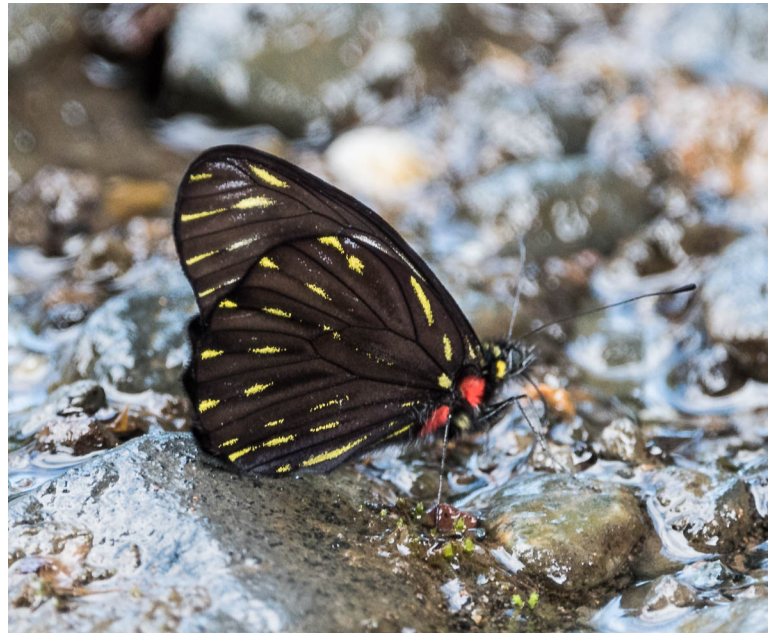
Top: Two species of Green-eyed White ( Leptophobia sp.) Bottom Left: Black-rayed Melwhite Bottom Right: Black-vented Dartwhite