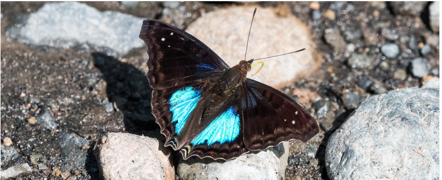
Top: Big-thumbed Banner Bottom: Cyan Emperor