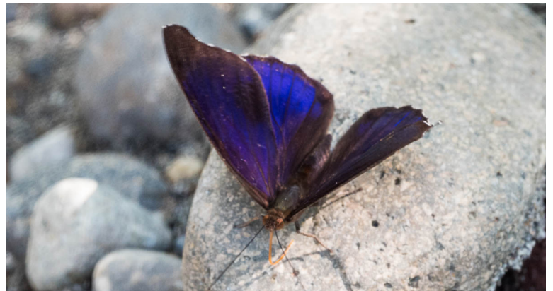
Bottom Left: Double Crescent Purplewing