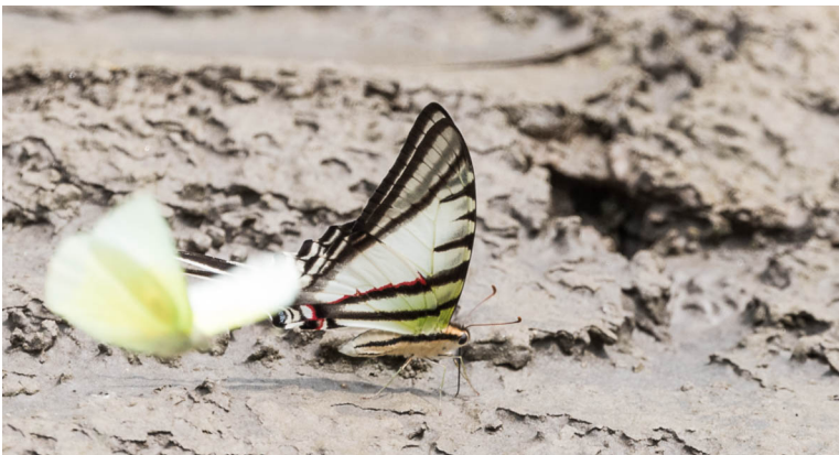
Mud-puddling Pierids and Swallowtails on the Napo River Bottom Left: Kite-Swallowtail