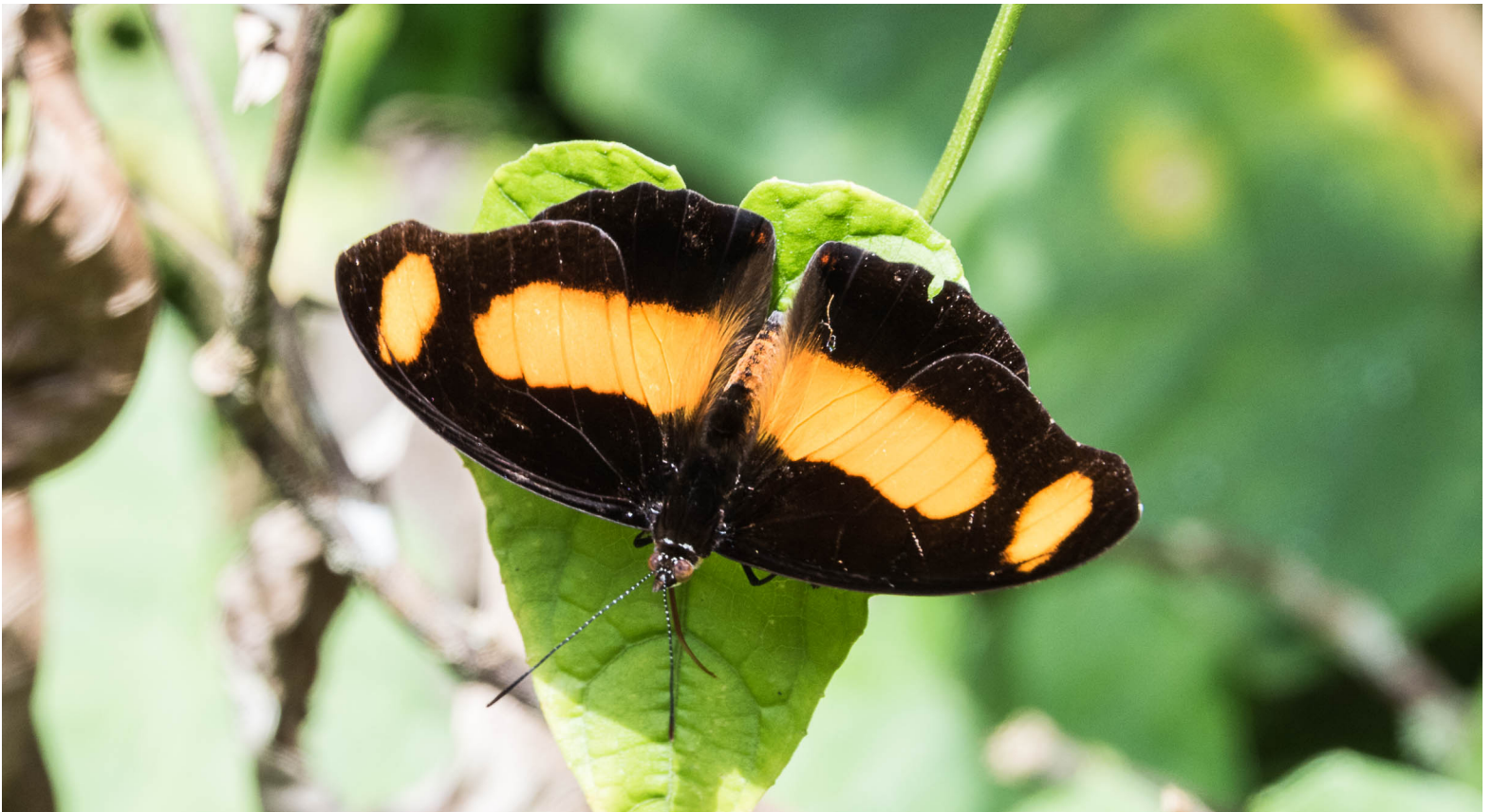
Top Left: Neglected Eighty-Eight