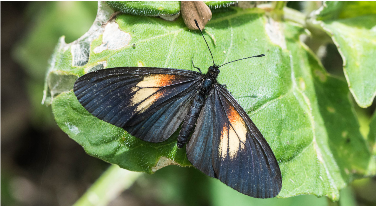
Top Left: Pink-bodied Actinote