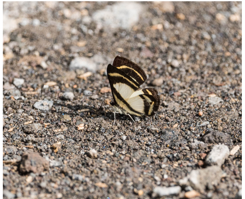
Top Left: Cloudy-eyed Whitemark Bottom Left: Calephelis sp.