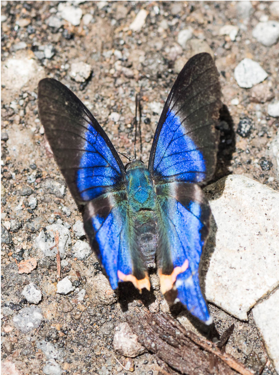
Metalmark: Pink-C Beautymark Front Cover: Scarlet Peacock