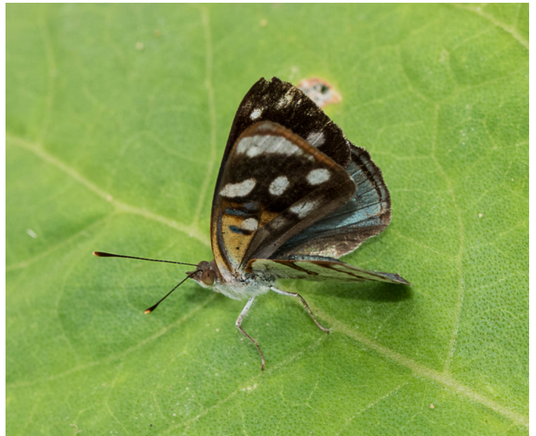
Top Left: Callicore tolima Bottom Left: Pink-celled Leafwing (female)