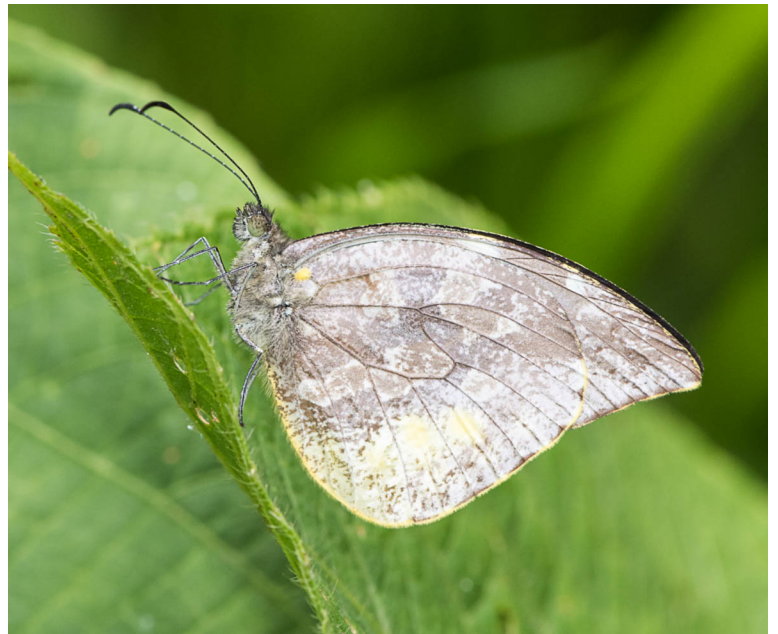
Top Left: Cross-barred White Bottom Left: Orange-bordered Mimic-White