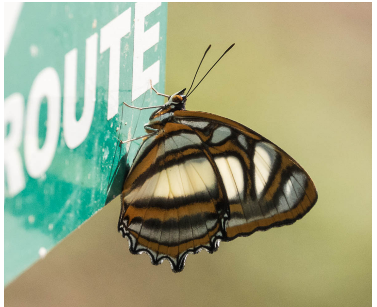
Top Left: Tailed Cecropian Bottom Left: Blue-bordered Panacea