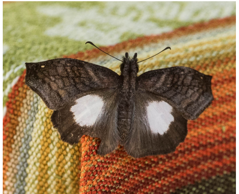
Top Left: Mylon sp. Bottom Left: Colombian Bentwing