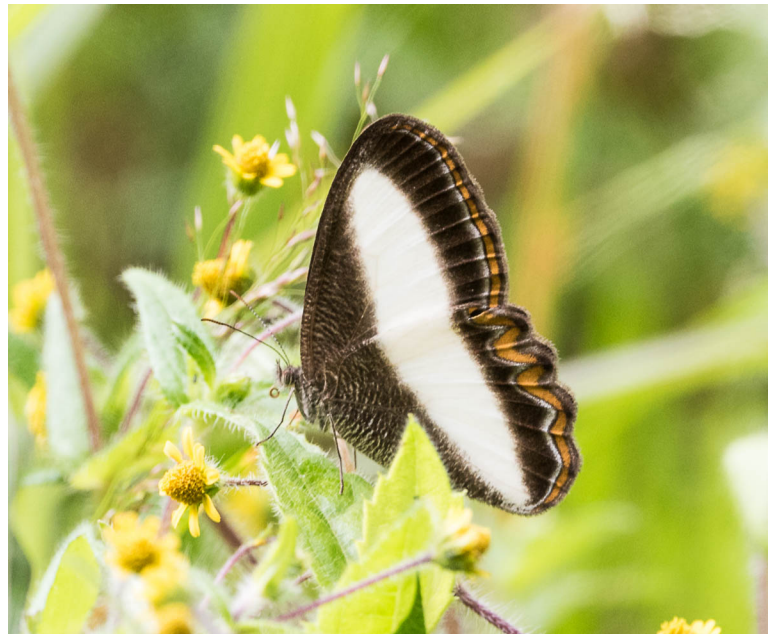
Top Left: Pallid Cloud-Satyr Bottom Left: Euptychoides nossis