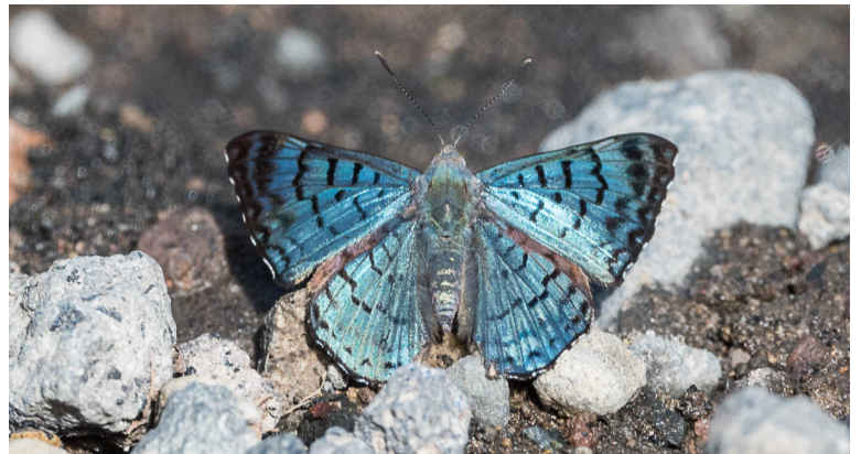
Bottom Left: Blue-bordered Metalmark