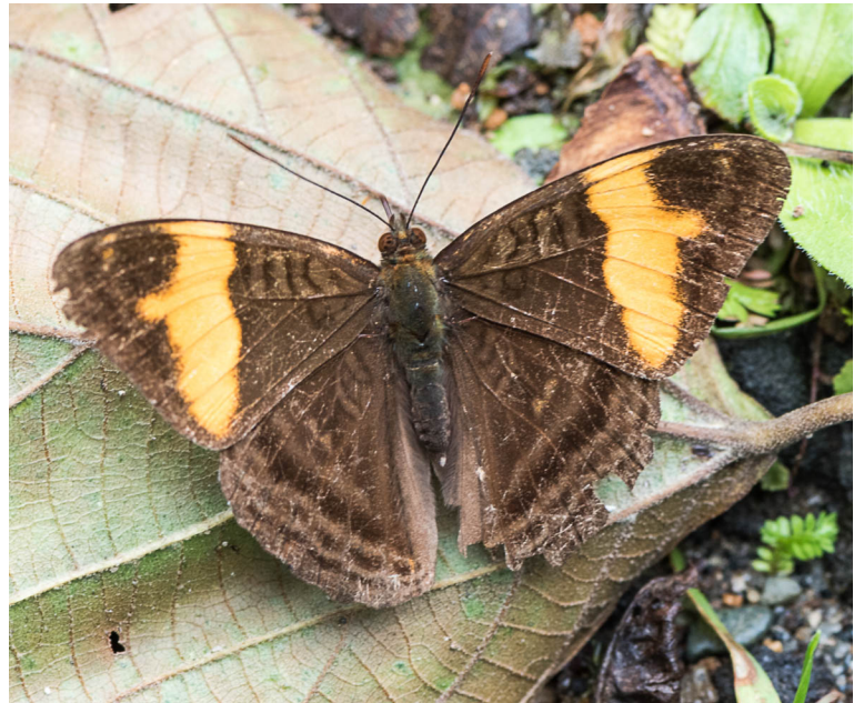
Top Left: Rayed Sister Bottom Left: East Andean Sister