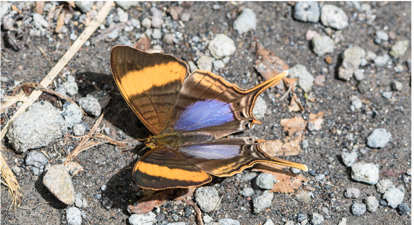
Top Left: Orange-edged Daggerwing