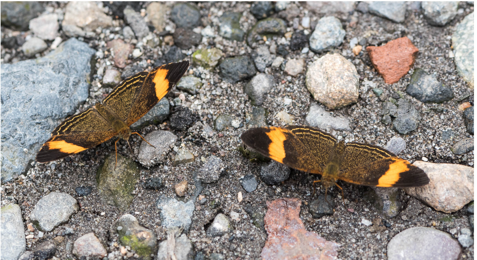
Top Left: Mimic Crescent