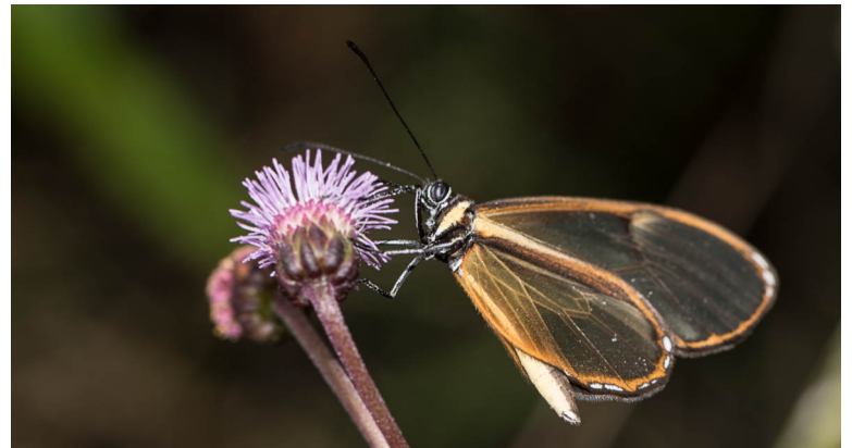
Bottom Right: Episcada tucidella