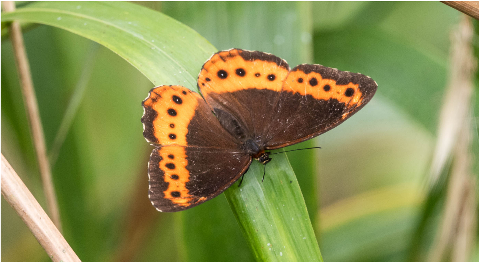
Top Left: Fiery Satyr