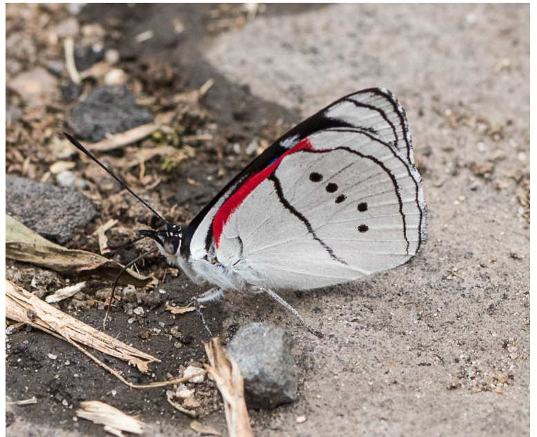
Top: Blue-Spotted Pericloud (underside and upperside)