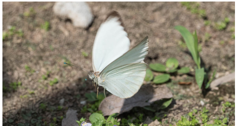
Bottom Right: Great Southern White