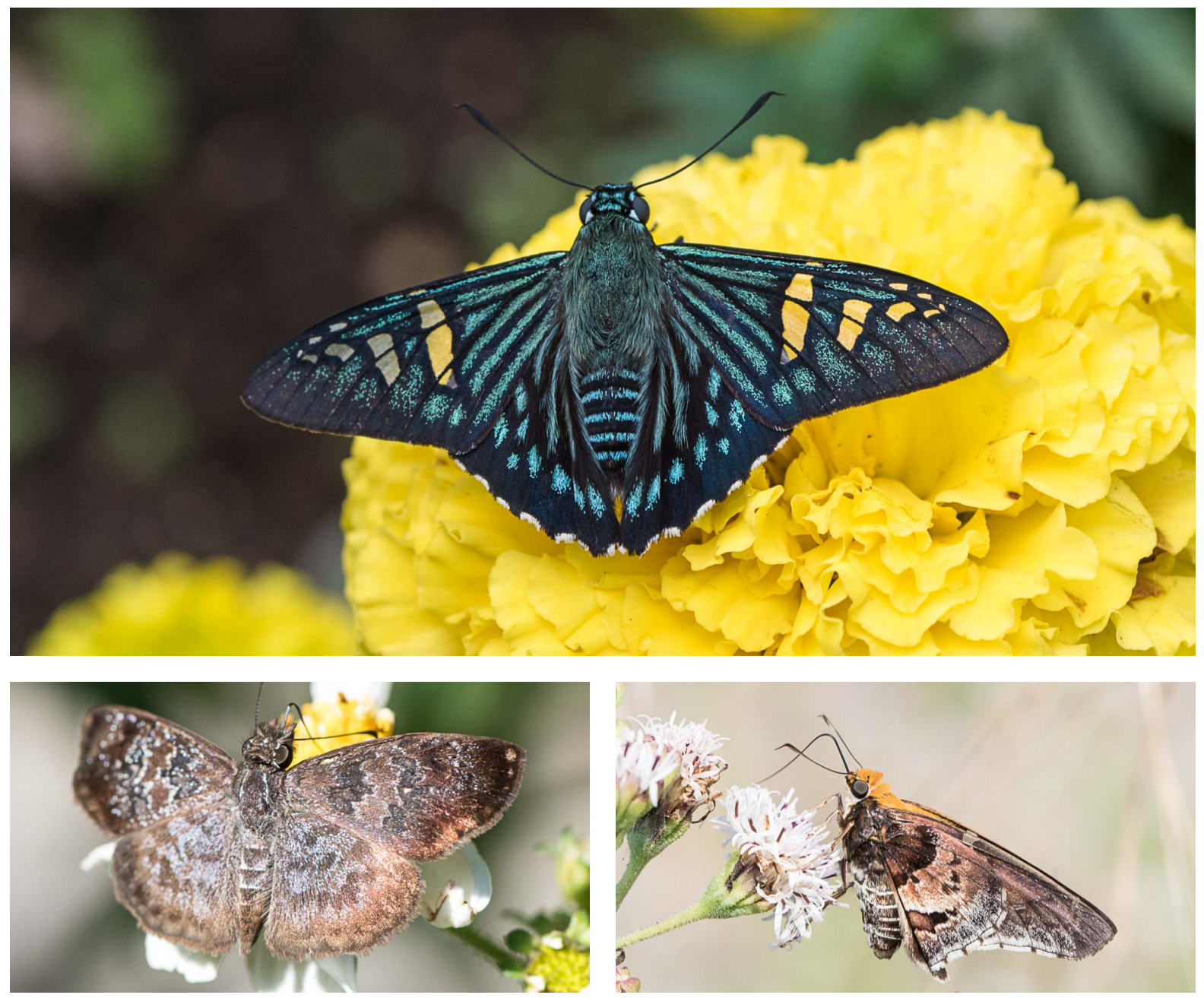
Butterflies - Skippers - Top: Teal Beamer aka Rainbow Skipper ( Phocides urania ) Bottom Left: Blue-studded Skipper & Right: Mercurial Skipper