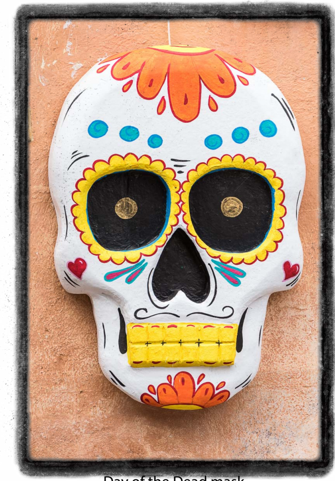
Day of the Dead mask