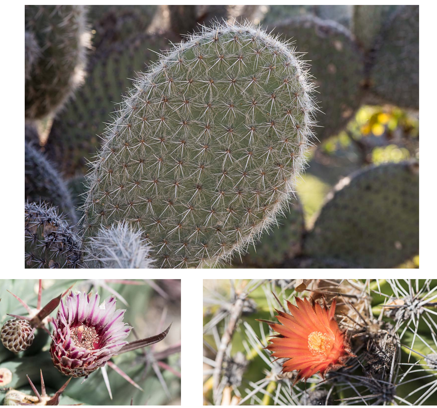
Cacti - Top: A Prickly Pear ( Opuntia sp.) Bottom Left: Ferocactus recurvus & Right: Ferocactus flavovirens