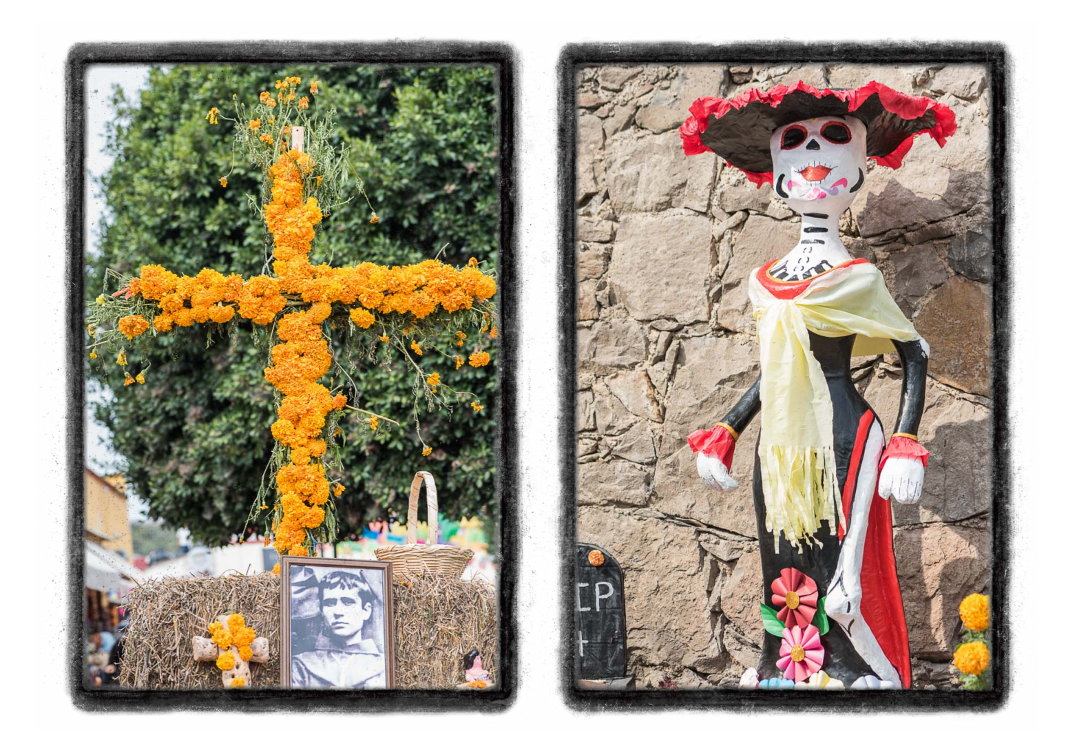
Day of the Dead - the Mexican celebration for those who have died.