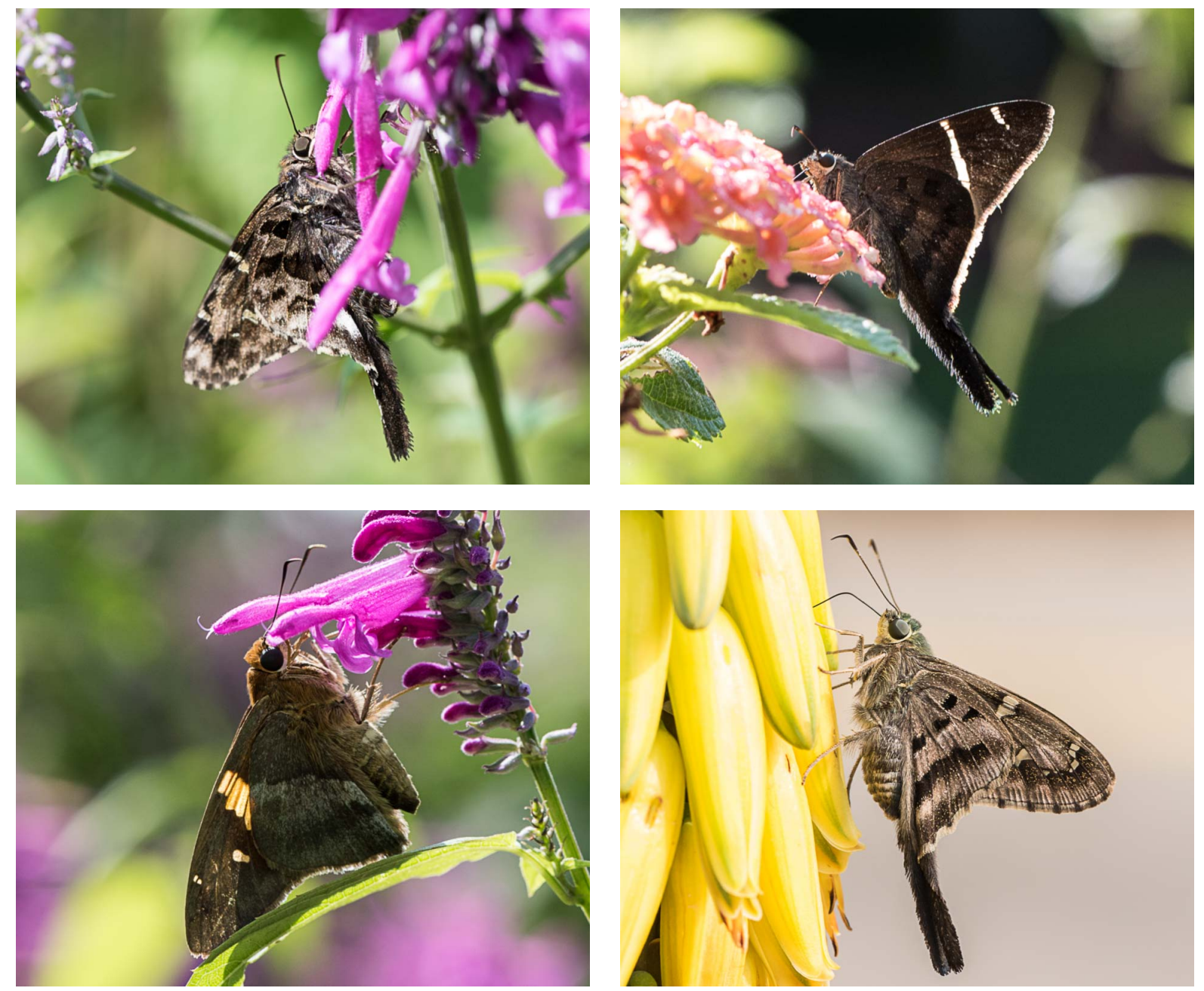
Butterflies - Skippers - Top Left: Codatractus sp. & Right: Teleus Longtail Bottom Left: Gold-spotted Aguna & Right: Plain Longtail