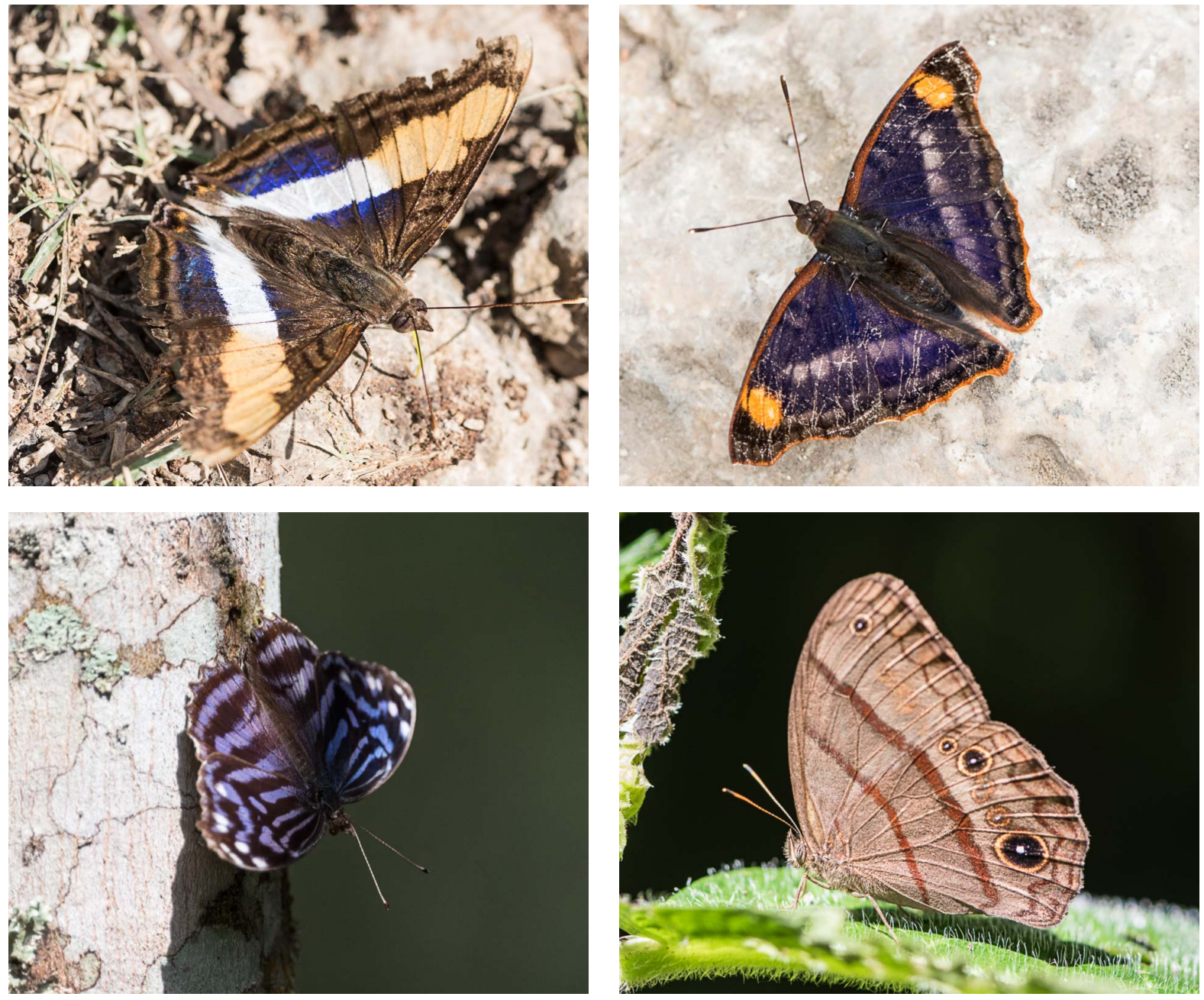
Butterflies - Top Left: Silver Emperor & Right: Pavon Emperor Bottom Left: Mexican Bluewing & Right: Wide-bordered Satyr