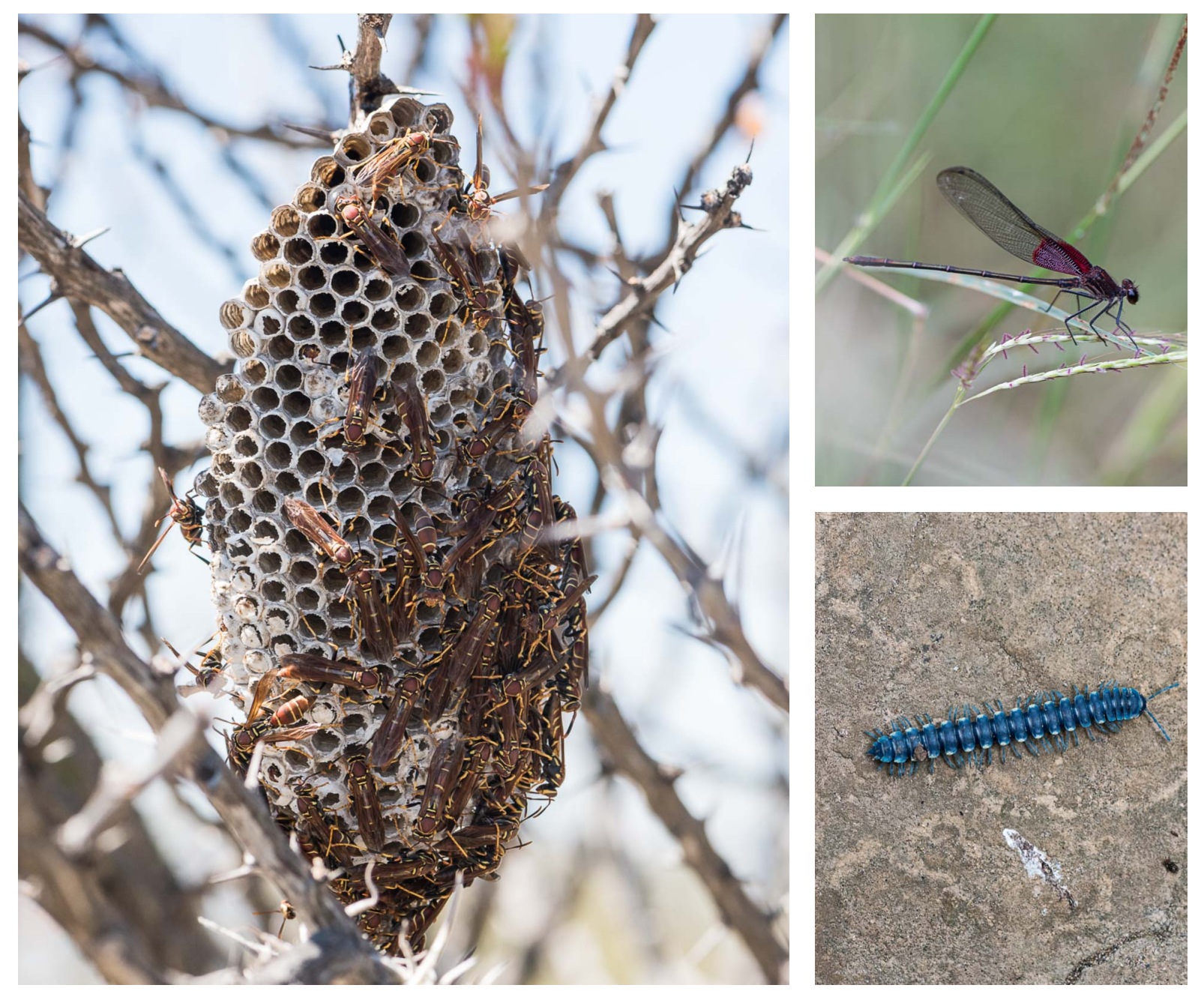
Left: Wasp nest - Polistes instabilis Right Top: Rubyspot & Below: A blue Millipede