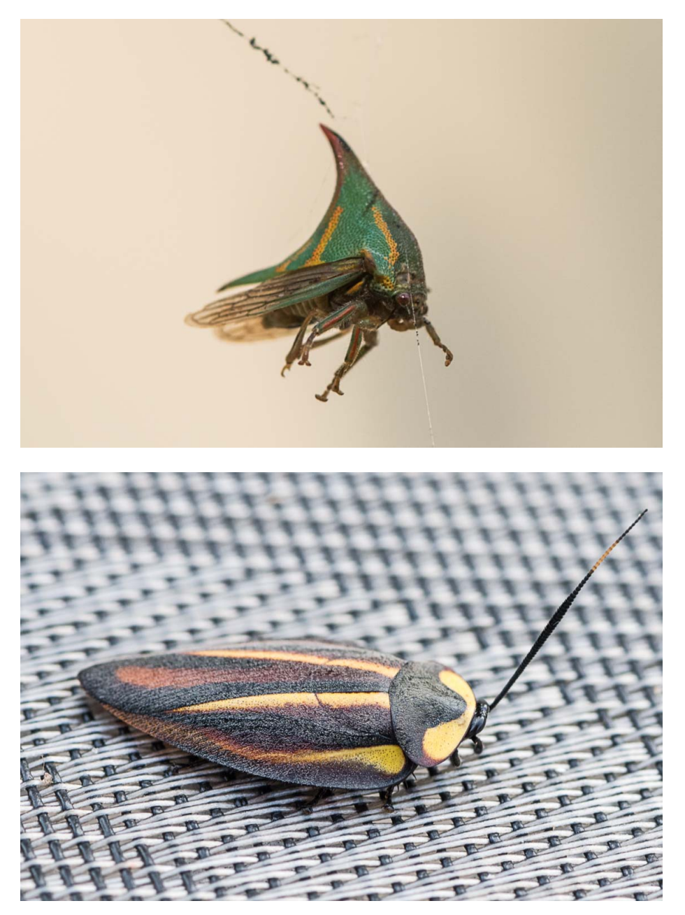
Top: Thorn Treehopper Bottom: Cockroach ( Rochaina mexicana )