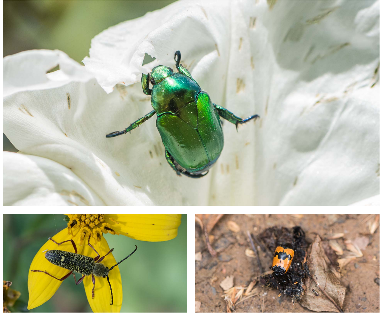
Beetles - Top: Calomacraspis splendens Bottom Left: A Long-horned Beetle & Right: Margined Burying Beetle ( Nicrophorus olidus )