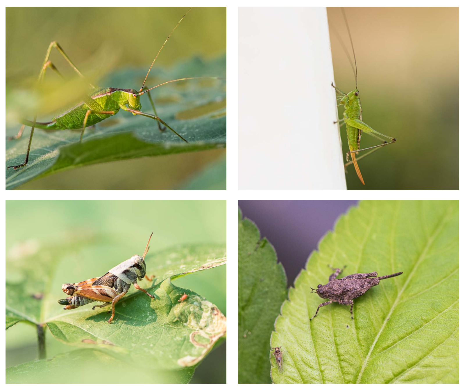
Orthoptera - Top Left: Common Short-wing Katydid & Right: Mexican Bush Katydid Bottom Left: Atztec Spur-throated Grasshopper & Right: Pygmy Grasshopper