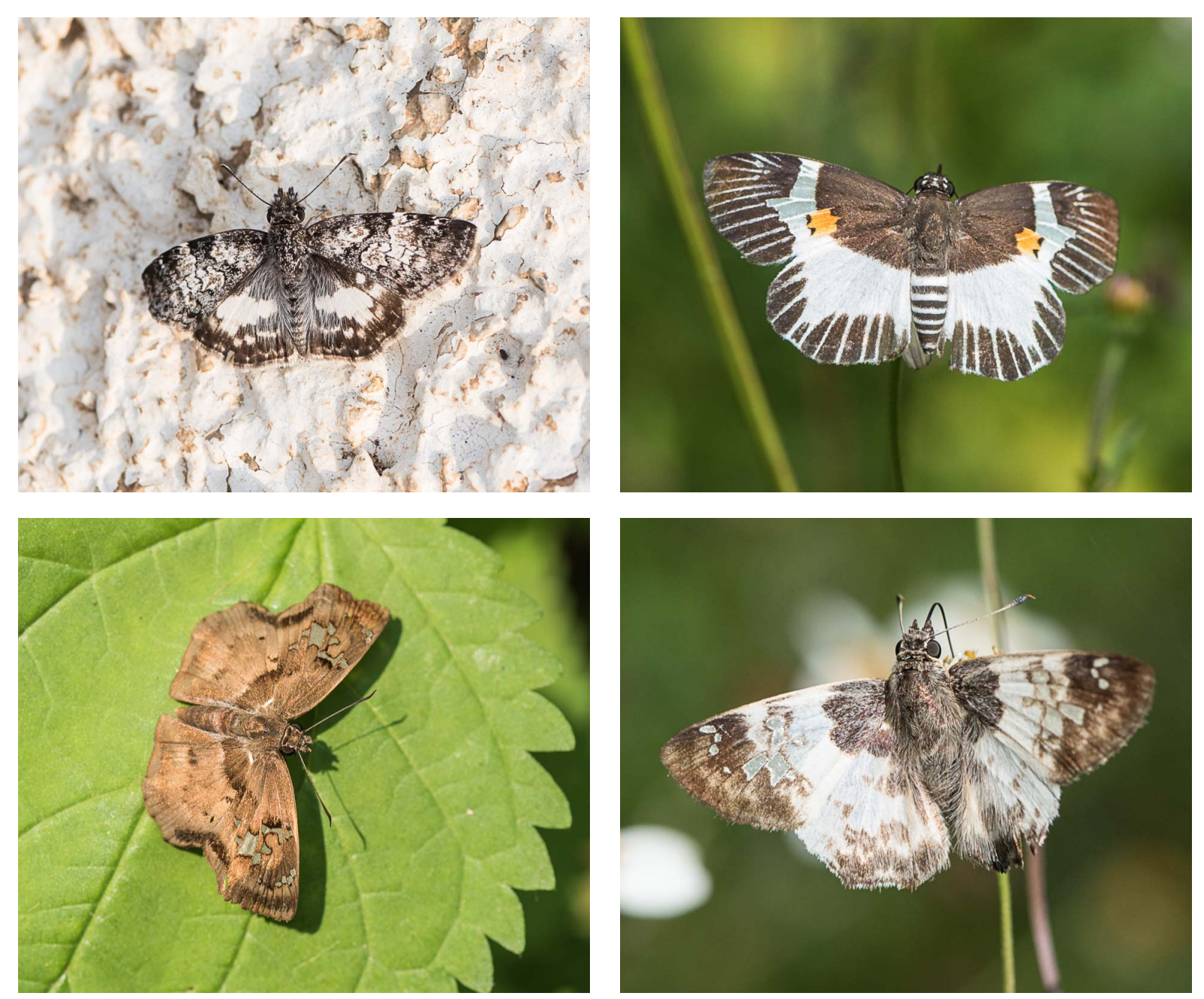
Butterflies - Skippers - Top Left: White-patched Skipper & Orange-spot Skipper Bottom: Lugubrious Blue Skipper & Cleta-Tufted Skipper (aka White Enops)