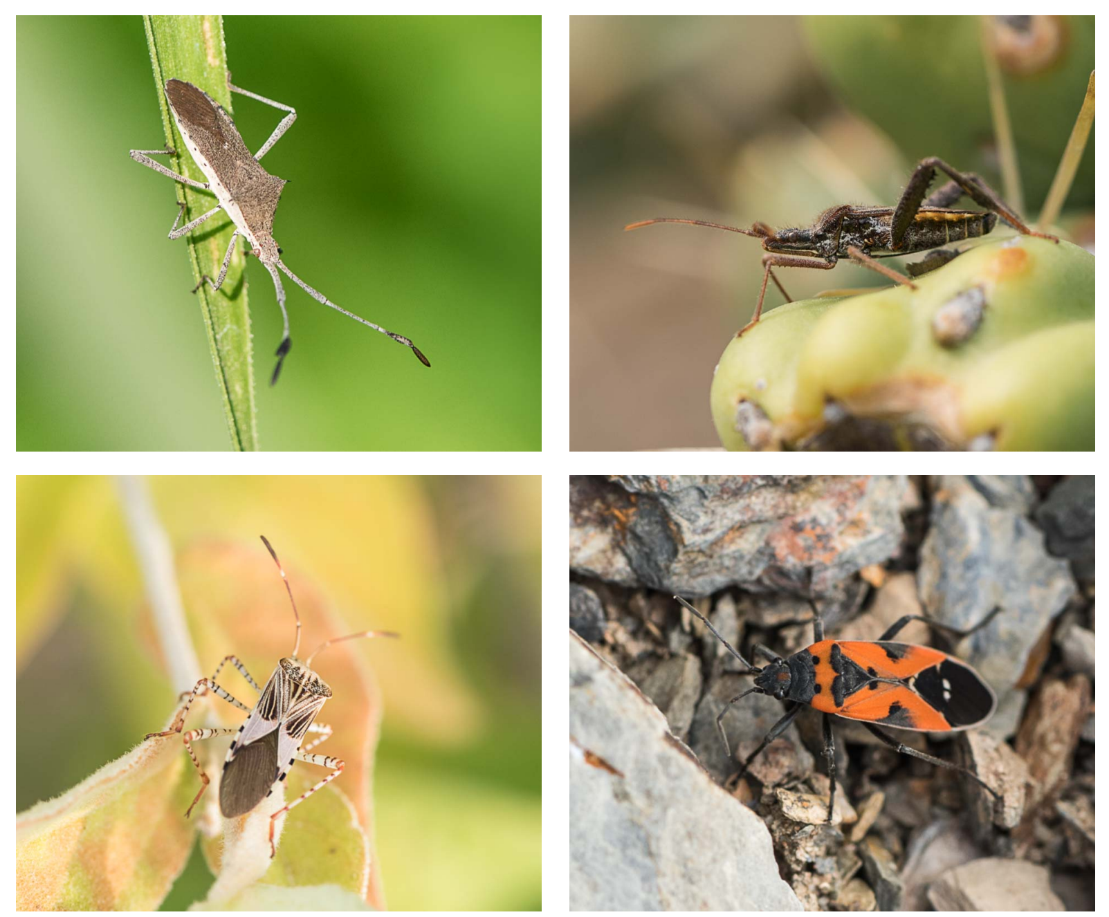
Bugs - Top Left: Euphorbia Bug & Right: Narnia sp. Bottom Left: Spot-sided Coreid & Right: Small Milkweed Bug