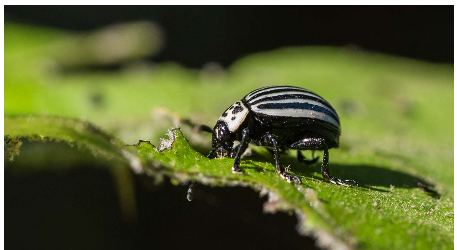
Beetles - Top: Two Long-horned Beetles - Ochraethes sp. Bottom: Potato Leaf Beetle ( Leptinotarsa undecimlineata )