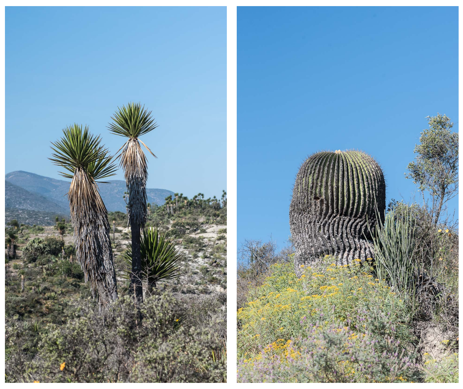
Near to Tehuacan-Cuicatlan Biosphere Reserve - Left: Yucca & Right: a barrel cactus (Echinocactus sp)