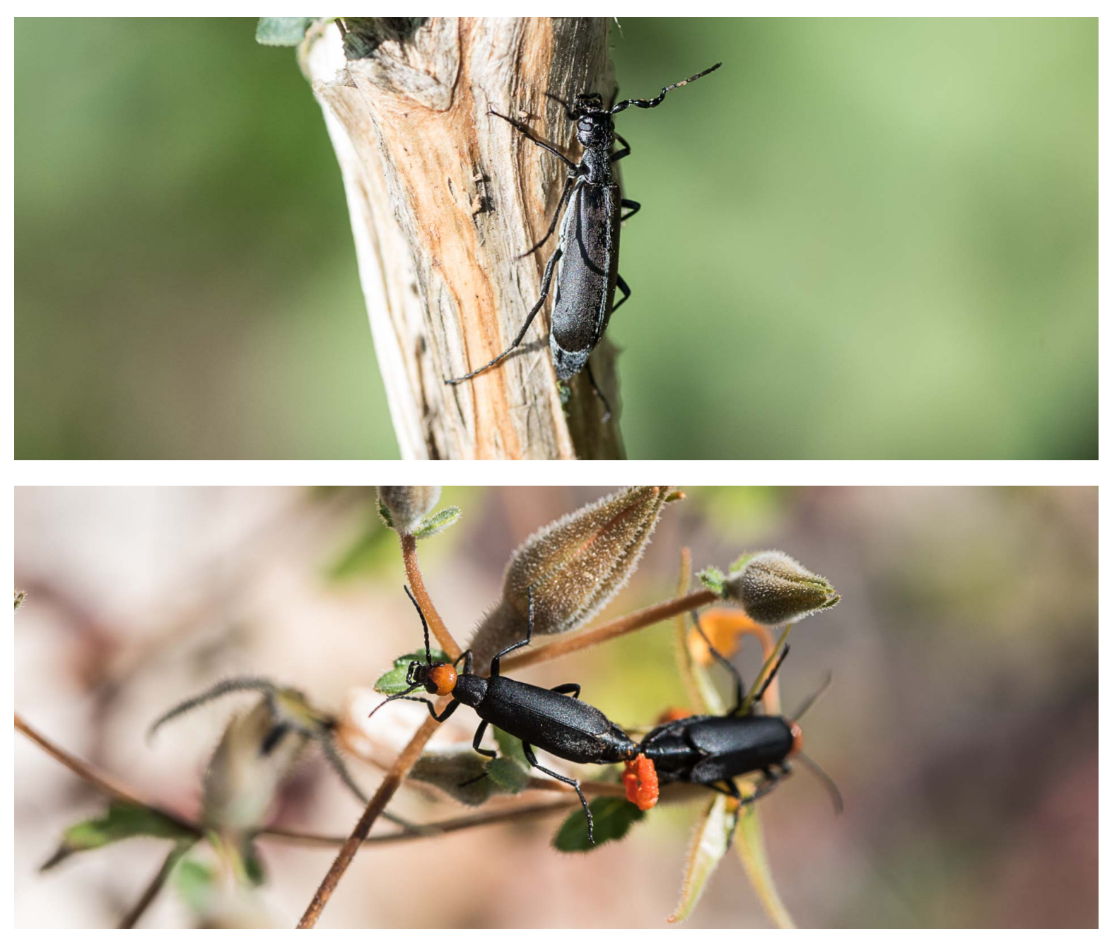
Beetles - Top: Blister Beetle ( Epicauta curvicornis ) Bottom: Red-headed Blister Beetle ( Epicauta atrata )