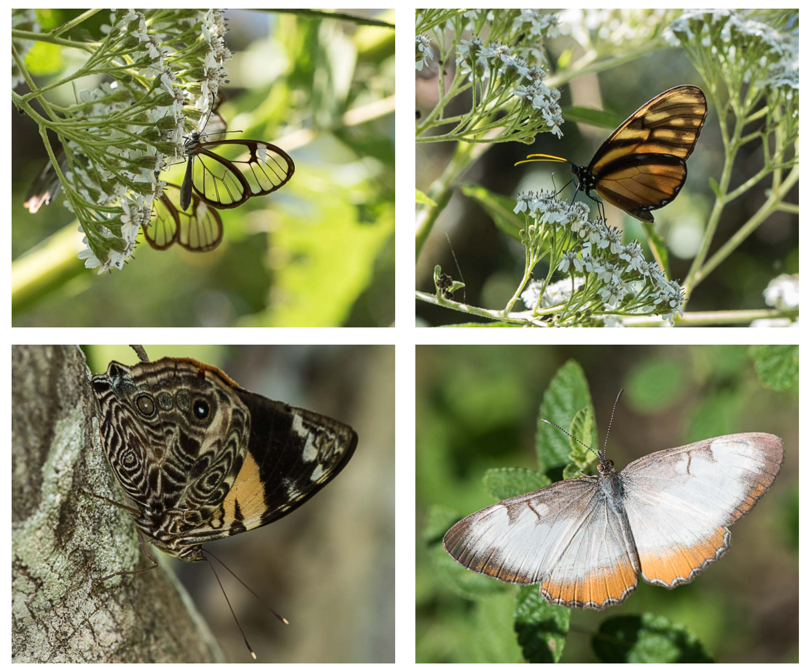
Butterflies - Top Left: Salvin's Ticlear & Right: Klug's Clearwing Bottom Left: Blomfilds Beauty & Common Mestra