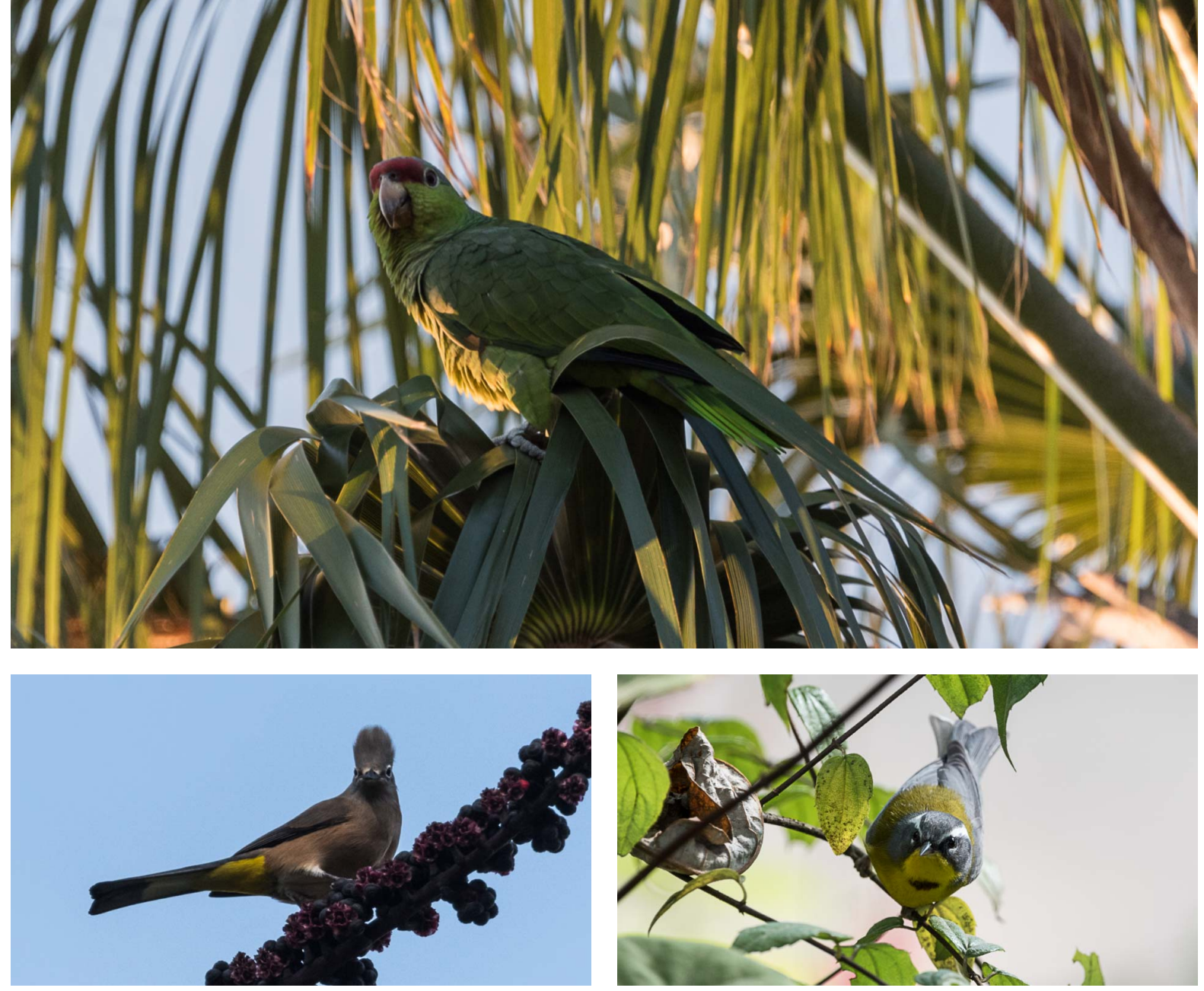
Top: Red-lored Parrot Bottom Left: Grey Silkie & Right: Crescent-chested Warbler