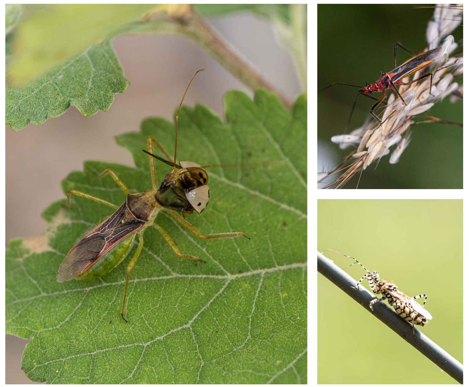
Assassin Bugs - Left: Zeleus sp. Right Top: Repipta taurus & Bottom: Ringed Assassin Bug