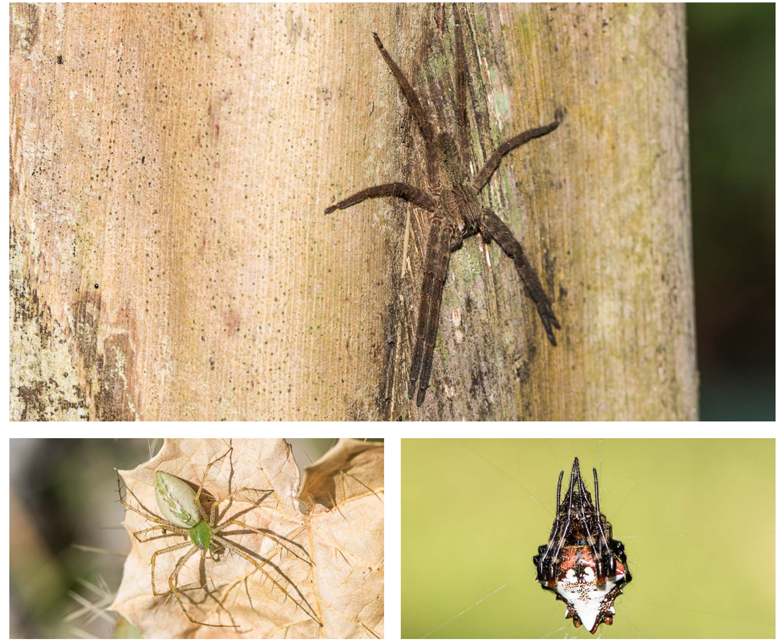
Spiders - Top: Bromeliad Spider Bottom Left: Green Lynx Spider & Right: Arrowhead Orb Weaver