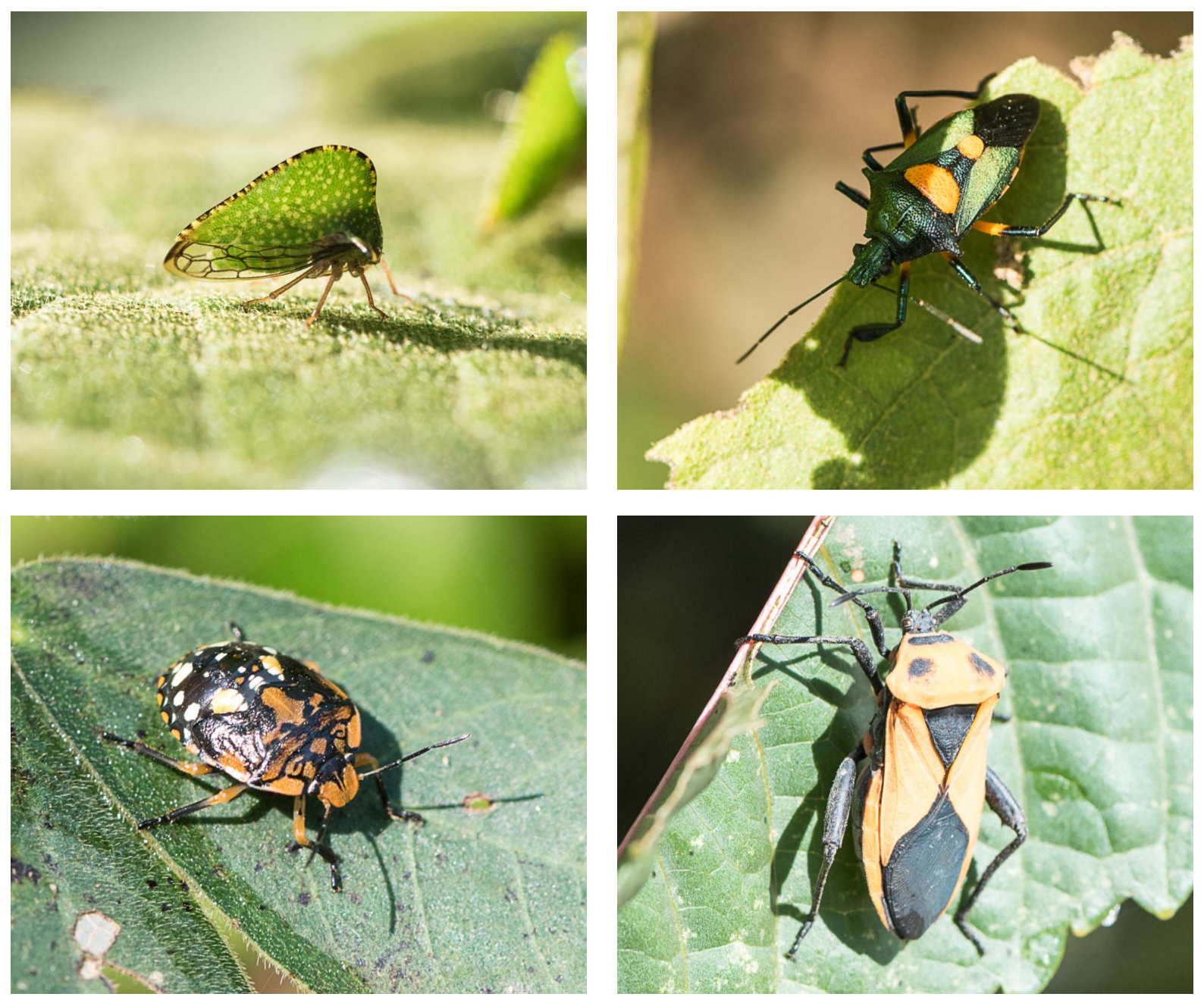
Bugs - Top Left: Solanaceous Treehopper & Right: Florida Predatory Stink Bug Bottom Left: Green Stink Bug (nymph) & Right: Sagotylus confluens