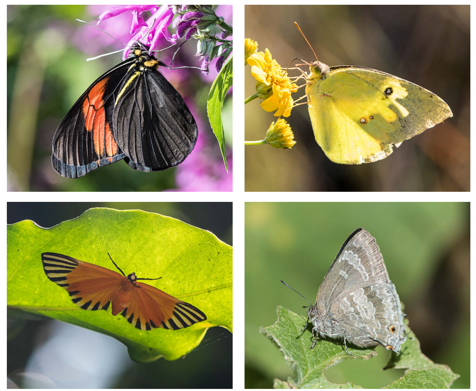
Butterflies - Top Left: Surprising White & Right: Southern Dogface Bottom Left: Zebra-tipped Geomark & Right: Chained Hairstreak