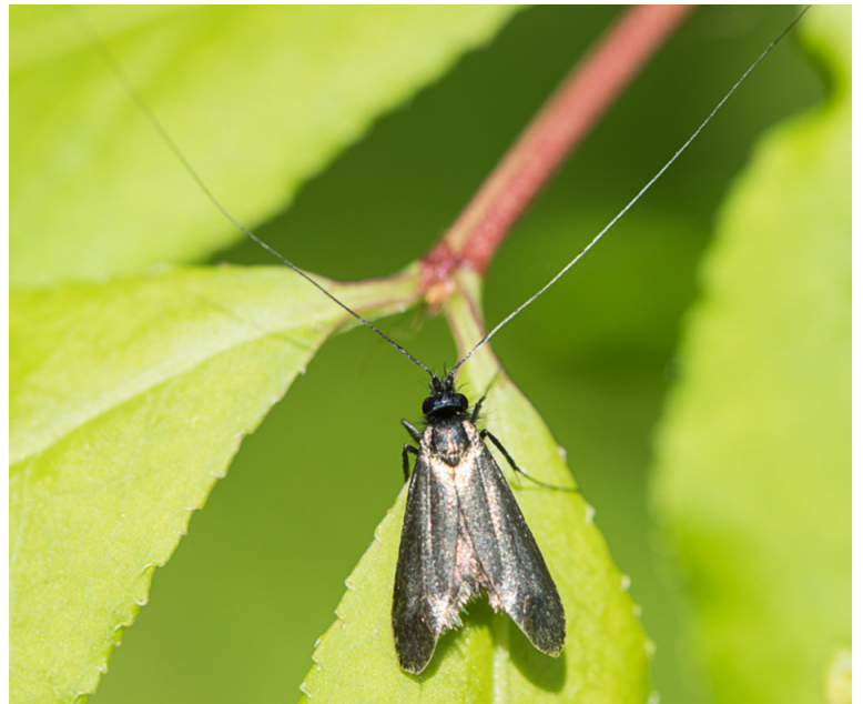
: Top left - Sulphur Tubic with Long-horned moths: Top right - Nematopogon sp and Bottom - Adela reaumurella