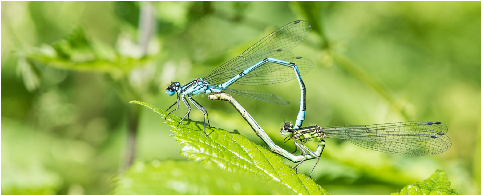
Mating Damselflies - Top - Large Red Damselfly and Bottom - Azure Damselfly