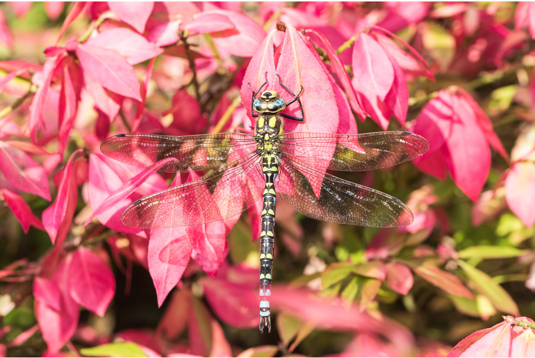
Male Southern Hawker