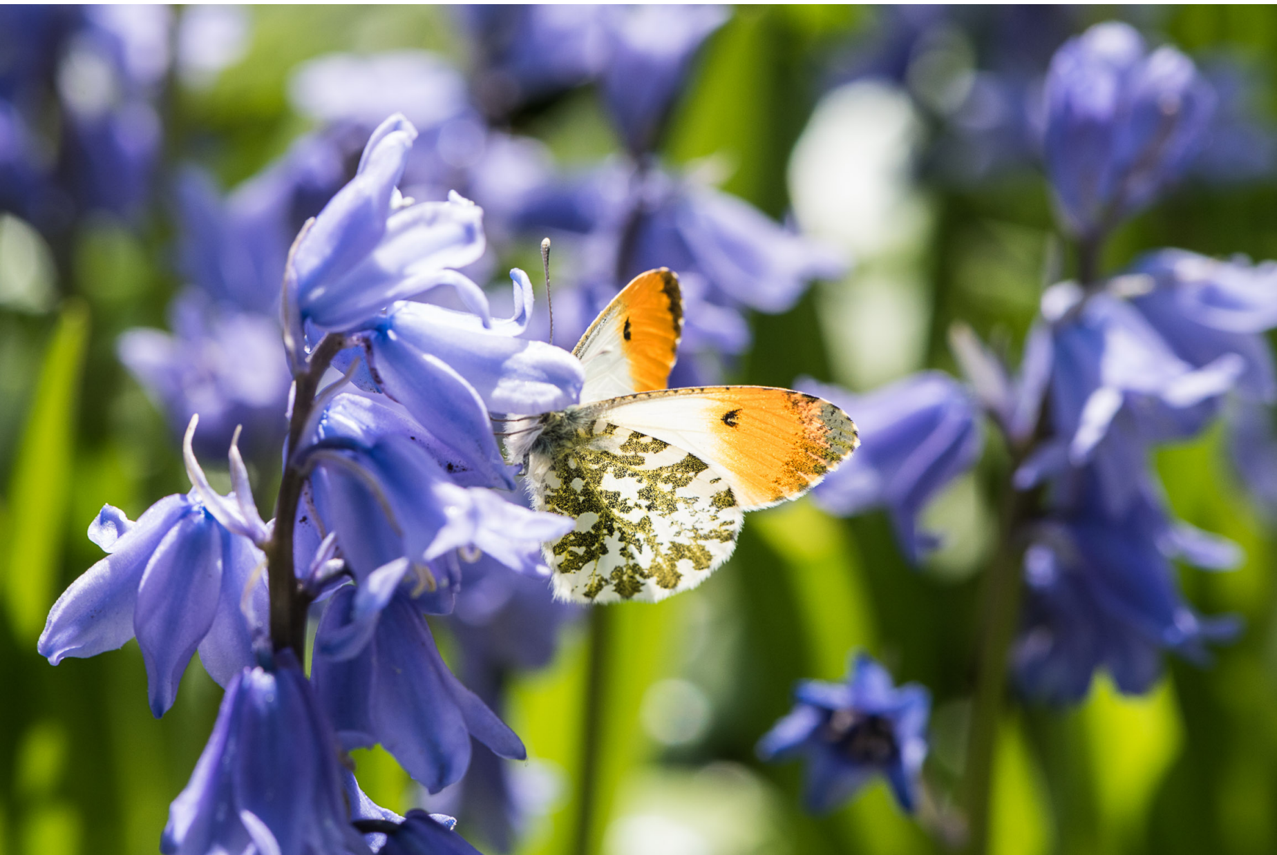
Male Orange Tip feeding on Bluebells