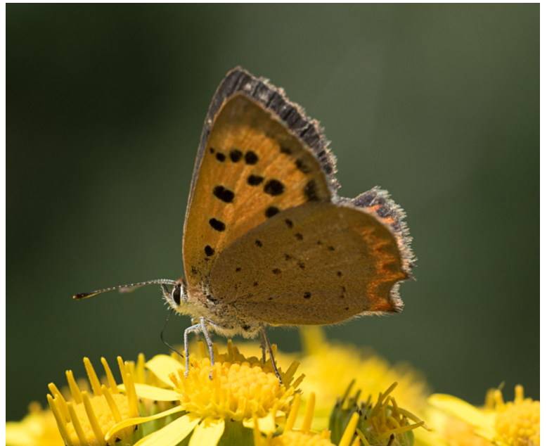
Top - Purple Hairstreak caterpillar & adult and Bottom left- Mating Common Blues and Bottom right - Small Copper