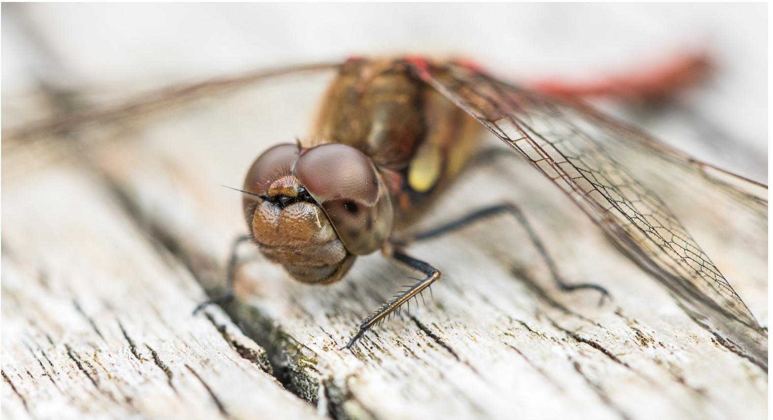
Top left and Bottom - Male Common Darter and Top right - Male Ruddy Darter (totally black legs and pinched abdomen)