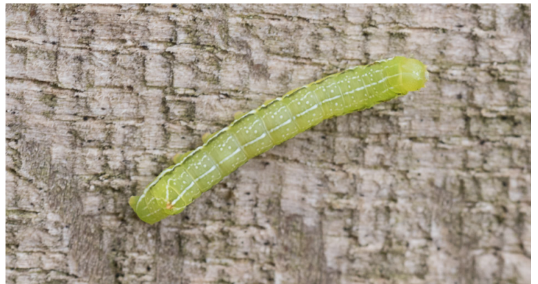
Typical May scene with plenty of caterpillars (Top), November Moth (Bottom left) and a Pinion Moth (Bottom right)