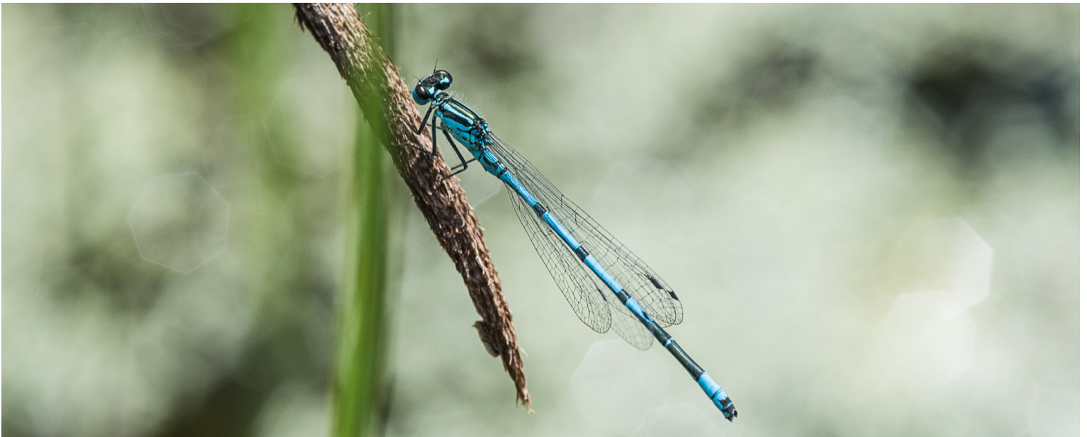
Top - Female Blue-tailed Damselfly and Bottom - Azure Damselfly