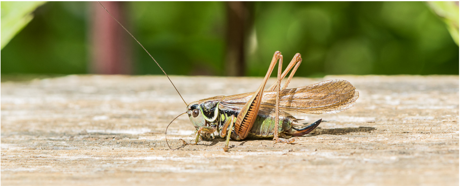
Top - Speckled Bush Cricket and Bottom Roesel's Bush Cricket