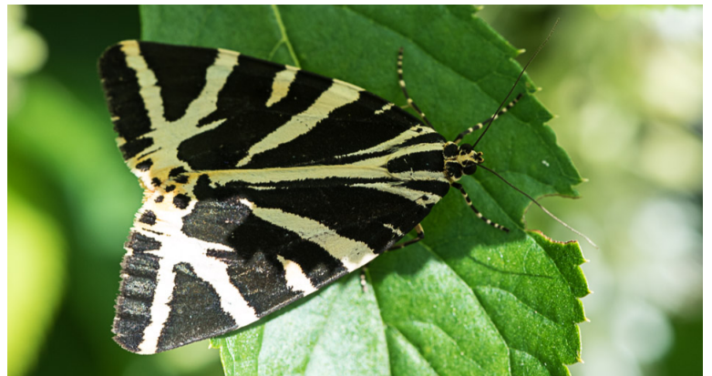
Jersey Tiger Moth