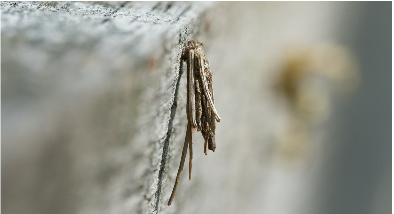
Top left - Oak Leaf Roller, Top right - Satellite Moth, Bottom - a female Bagworm (a moth)