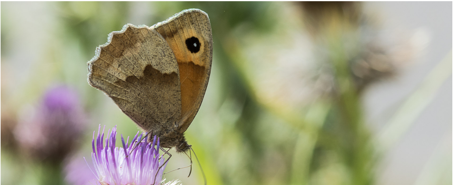
Top - Gatekeeper and Bottom - Meadow Brown