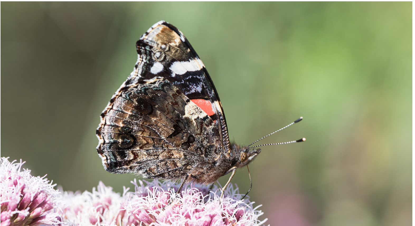
Top left and Bottom - Red Admiral and Top right - Painted Lady