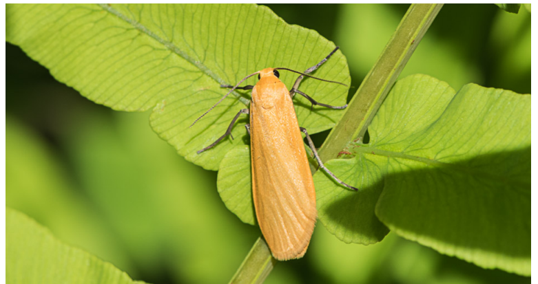
Top - Rosy Footman, Bottom left - Mint Moth and Bottom right - Orange Footman