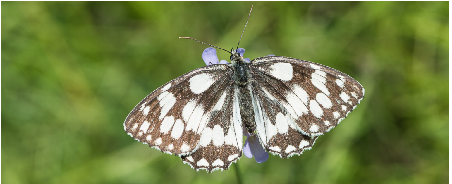
Top - Speckled Wood and Bottom - Marbled White