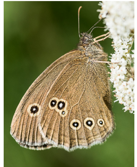
Right - Brimstone, Top right - Green Veined White and Bottom right - Ringlet