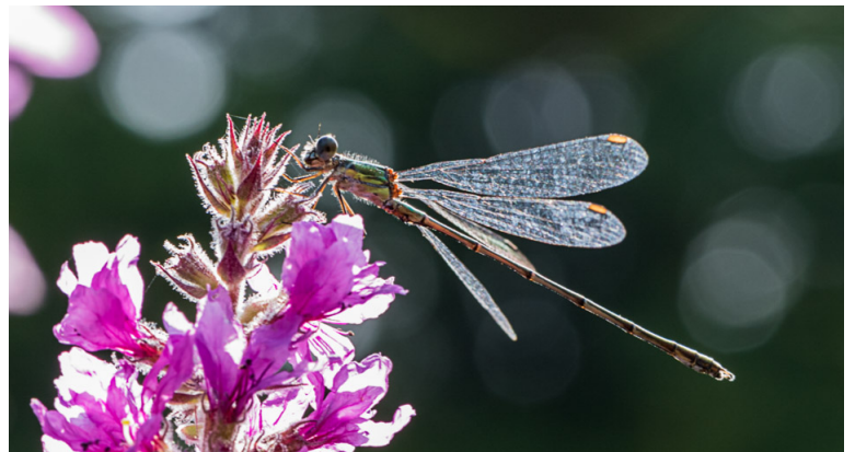
Willow Emerald - perhaps in commonest Damselfly around Thomson Pond in 2020