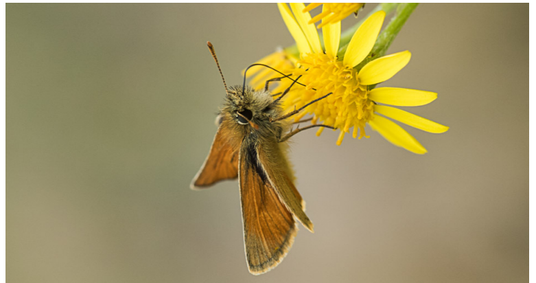
Top - a rare W-letter Hairstreak, Bottom left - Large Skipper and Bottom right - Small Skipper