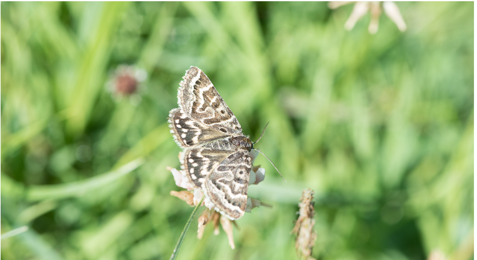
Top left - Brown-lined Moth, Top right - Antler Moth and Bottom - Mother Shipton