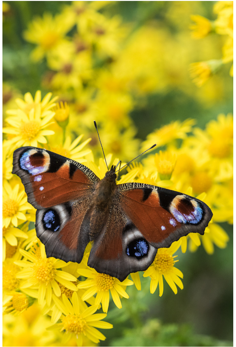
Left - Painted Lady and Right - Peacock